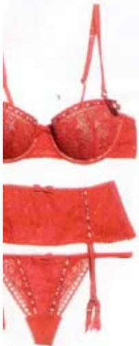
State nylon White Label bra, $69.95, suspender belt, $59.95, and G-string, $34.95; 02-9004 8077.