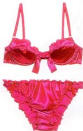
Lula Starr silk bra, $95, and briefs, $55; 0418 510 483.