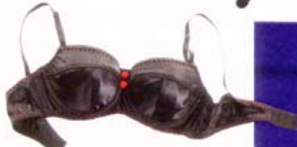
Lula Star "Bonita" bra, $110, and briefs, $65, from Dirty Pretty Things 02 9331 2066