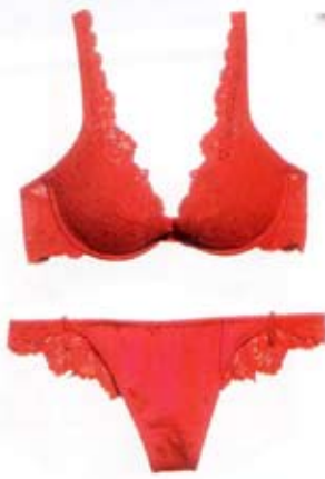
La Senza nylon-elastane bra, $49.95, and polyamide and nylon-elastane briefs, $18.95; 02-9281 8796.