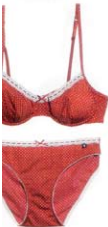
Empire nylon-elastane bra, $29.95, and briefs, $14.95; 1800 777 208.