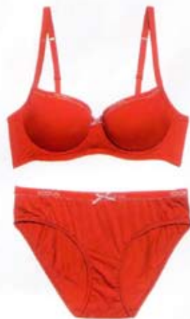
Kookai polyamide bra, $34.95, and briefs, $16.95; 02-9316 2907.