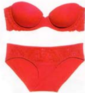
Kayser polyamide and nylon bra, $24.99, and briefs, $9.99; 1800 623 354.