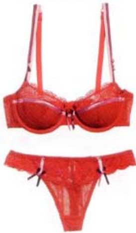
Hechter nylon-elastane bra, $120, and G-string, $65; at Sylvia Rhodes, 02-9362 0173.