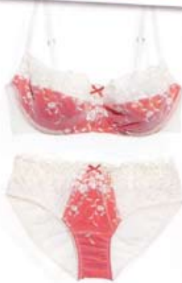
Roberta Glass nylon and spandex Valentine bra, $110, and briefs, $80; 02-9365 2181.