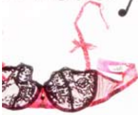
Aubade bra, $185, and g-string, $128 02 8338 0277

To get the pulse racing, turn up the heat in sizzling black sets